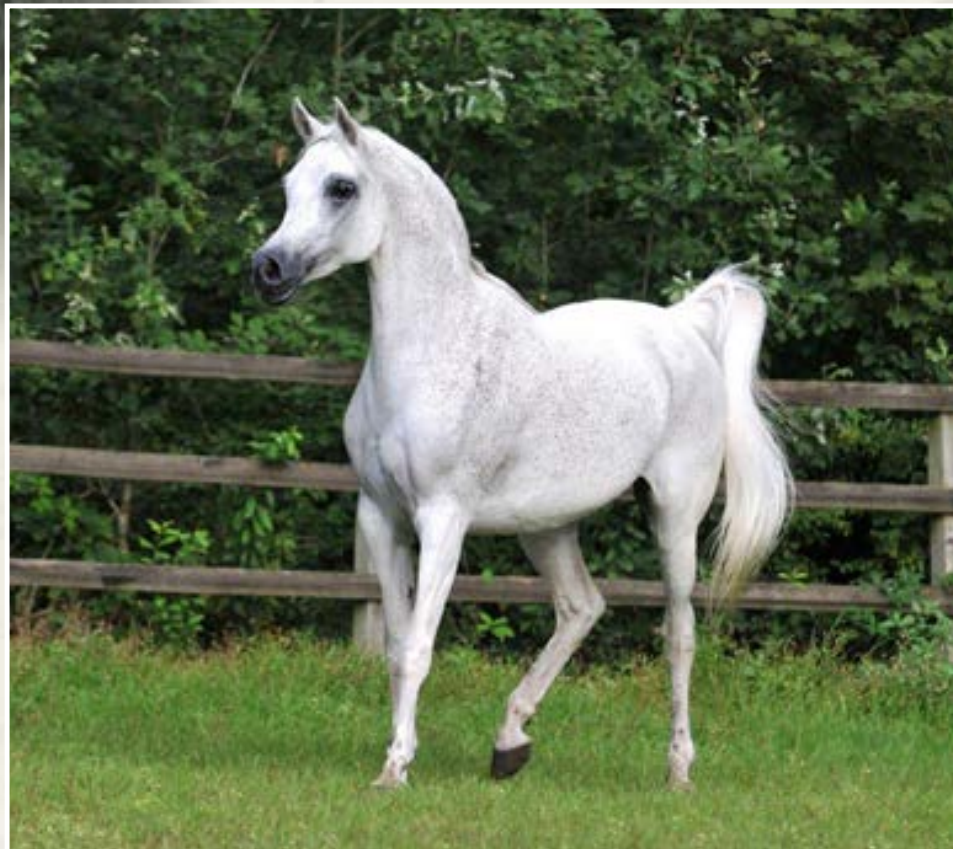
Mauhiba J (Ekstern x Starlight)