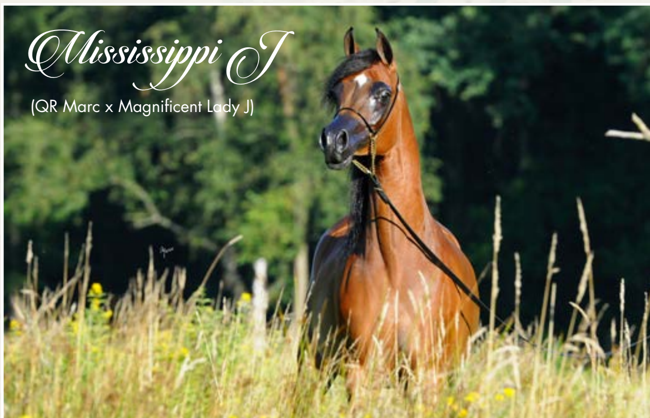
Mississippi J (QR Marc x Magnificent Lady J)