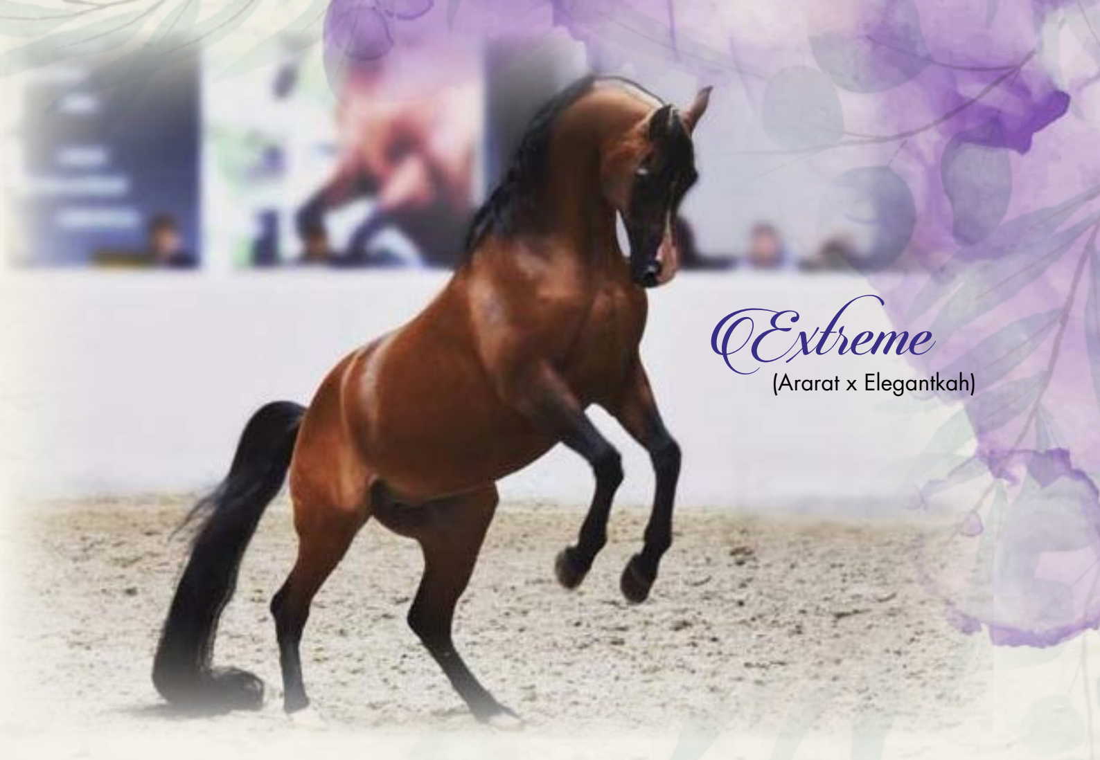
Extreme (Ararat x Elegantkah)